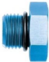
Plug, O-Ring Boss, , Aluminum, Anodized