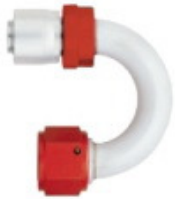
Fitting, Male Flare, , Brass,