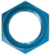
Locknut, , Aluminum, Anodized