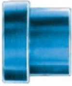
Fitting, Tube Sleeve, , Aluminum, Anodized