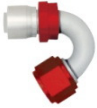
Fitting, Elbow, 180 deg., Aluminum, Anodized