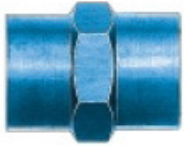
Adapter, Pipe to Pipe, , Aluminum, Anodized