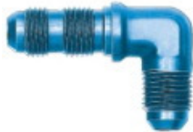
Adapter, Bulkhead Union, 90 deg., Aluminum, Anodized