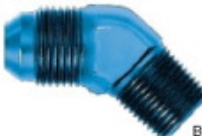
Adapter, Male Flare to Pipe, 45 deg., Aluminum, Anodized