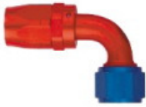
Fitting, Elbow, 90 deg., Aluminum, Crimp