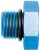
Plug, O-Ring Boss, , Aluminum, Anodized