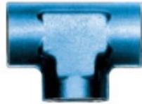
Adapter, Female Flare Tee, , Aluminum, Anodized