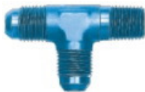
Adapter, Pipe Coupling, , Aluminum, Anodized