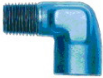
Adapter, Elbow, Female to Male Pipe, 90 deg., Aluminum, Anodized.jpgf