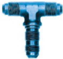
Adapter, Bulkhead Tee, , Aluminum, Anodized