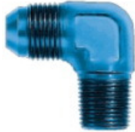
Adapter, Male Flare to Pipe, 90 deg., Steel,