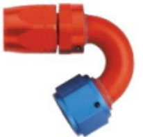
Fitting, Elbow, 150 deg., Aluminum, Crimp