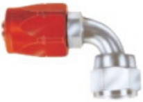
Fitting, Elbow, 120 deg., Aluminum, Anodized