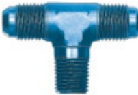
Adapter, Male Branch Tee, , Aluminum, Anodized