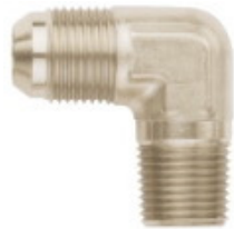
Adapter, Male Flare to Pipe, , Aluminum, Anodized