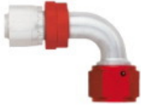
Fitting, Elbow, 90 deg., Steel,