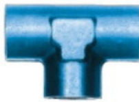
Adapter, Female Pipe Tee, , Aluminum, Anodized