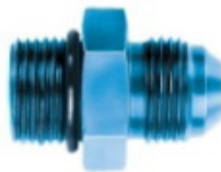
Adapter, Flare to O-Ring Boss , , Aluminum, Anodized