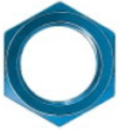
Locknut, , Aluminum, Anodized