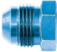
Plug, Flare, , Aluminum, Anodized