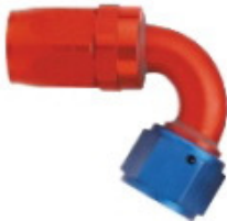
Fitting, Elbow, 120 deg., Aluminum, Crimp