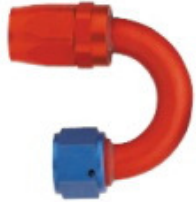
Fitting, Elbow, 180 deg., Aluminum, Crimp